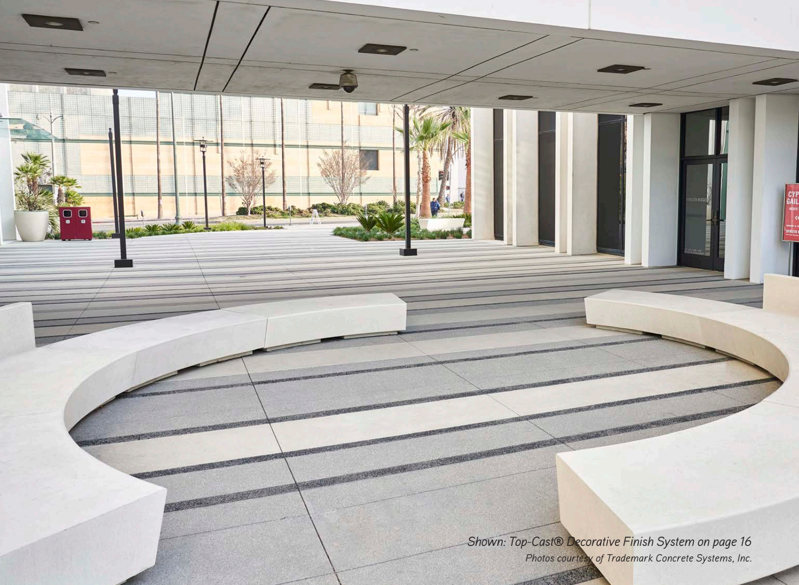
Shown: Top-Cast® Decorative Finish System on page 16